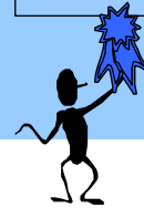
Figure 2: award for getting laptops in a school

Come to Seaforth College where you can get a head start with laptop and we can all be happy like figure 2